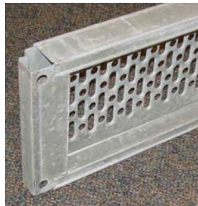
Metal plank with support pin holes