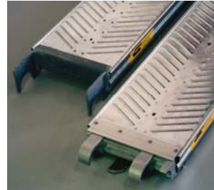
Metal plank with hooks