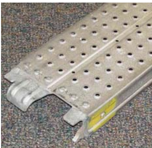
Metal plank with hooks