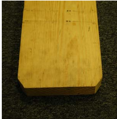
Solid Sawn Lumber