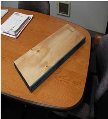
Laminated Veneer Lumber (LVL)