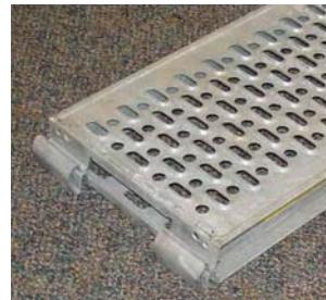
Metal plank with ledger channel hooks