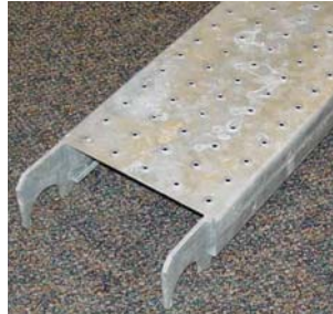
Metal plank with hooks