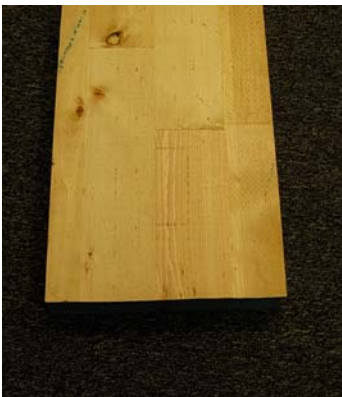
Edge Laminated Plank