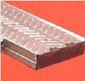
Metal Plank without hooks